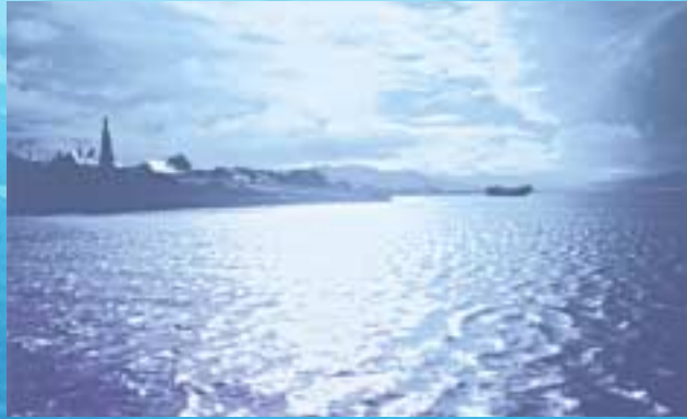
PORT STANLEY, FALKLAND ISLANDS